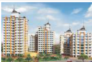
Ozone Valley Parsik Thane