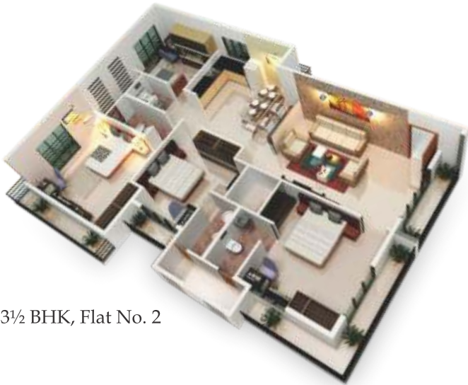
3½ BHK, Flat No. 2