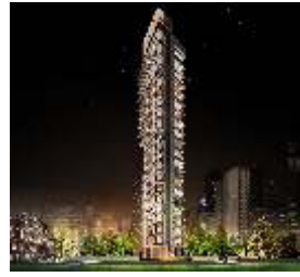
9 Radha Hindu Colony, Dadar