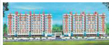
The Orchard Jalahalli, Bengaluru