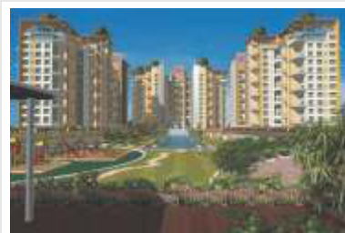
Golden Trellis Balewadi, Pune