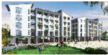
9 Windernest Sahan, Alibaug