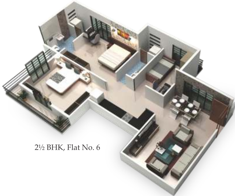
2½ BHK, Flat No. 6