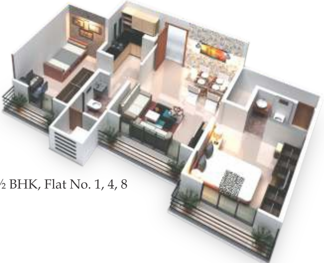
1½ BHK, Flat No. 1, 4, 8