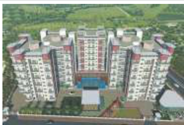
The Orchard Hadapsar, Pune