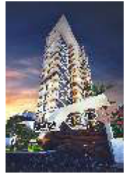
9 Almeida Almeida Park, Bandra