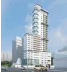
Durvankur Girgaum, Mumbai