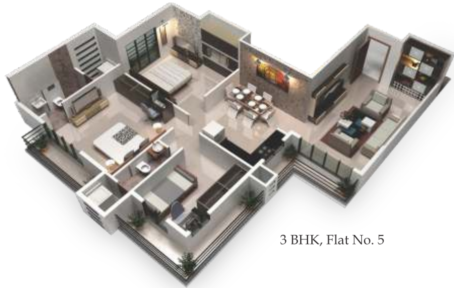
3 BHK, Flat No. 5