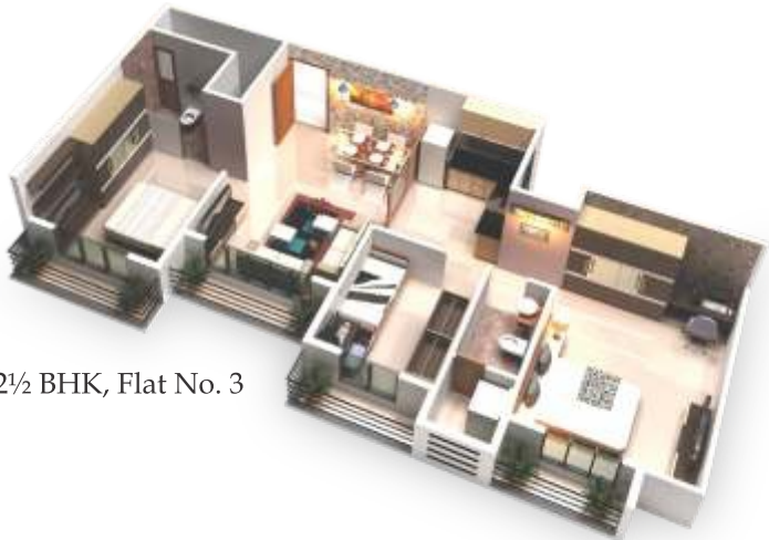
2½ BHK, Flat No. 3