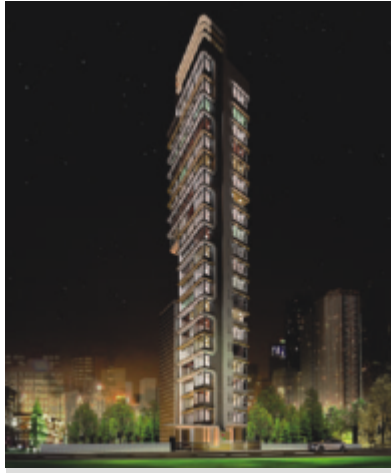
9 RADHA Hindu Colony, Dadar