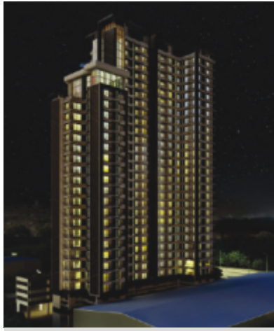
9 RIVIERA HILLS Parsik, Thane