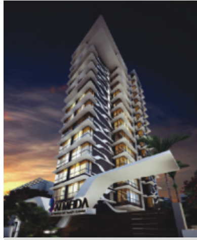
9 ALMEIDA Almeida Park, Bandra (W)