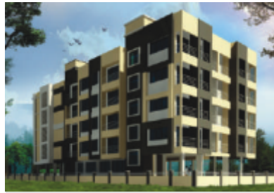
9 KRISHNA Badlapur